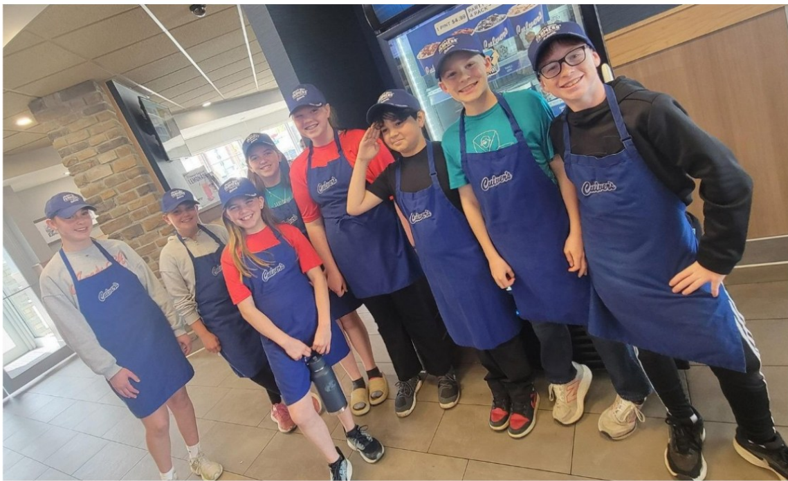
Our 5th-8th volunteers served customers with a smile and enthusiasm! We were grateful to see some alumni join us and don a blue apron for the night.