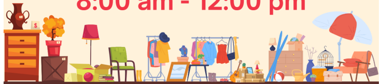
St. Barnabas Parish, Mazomanie